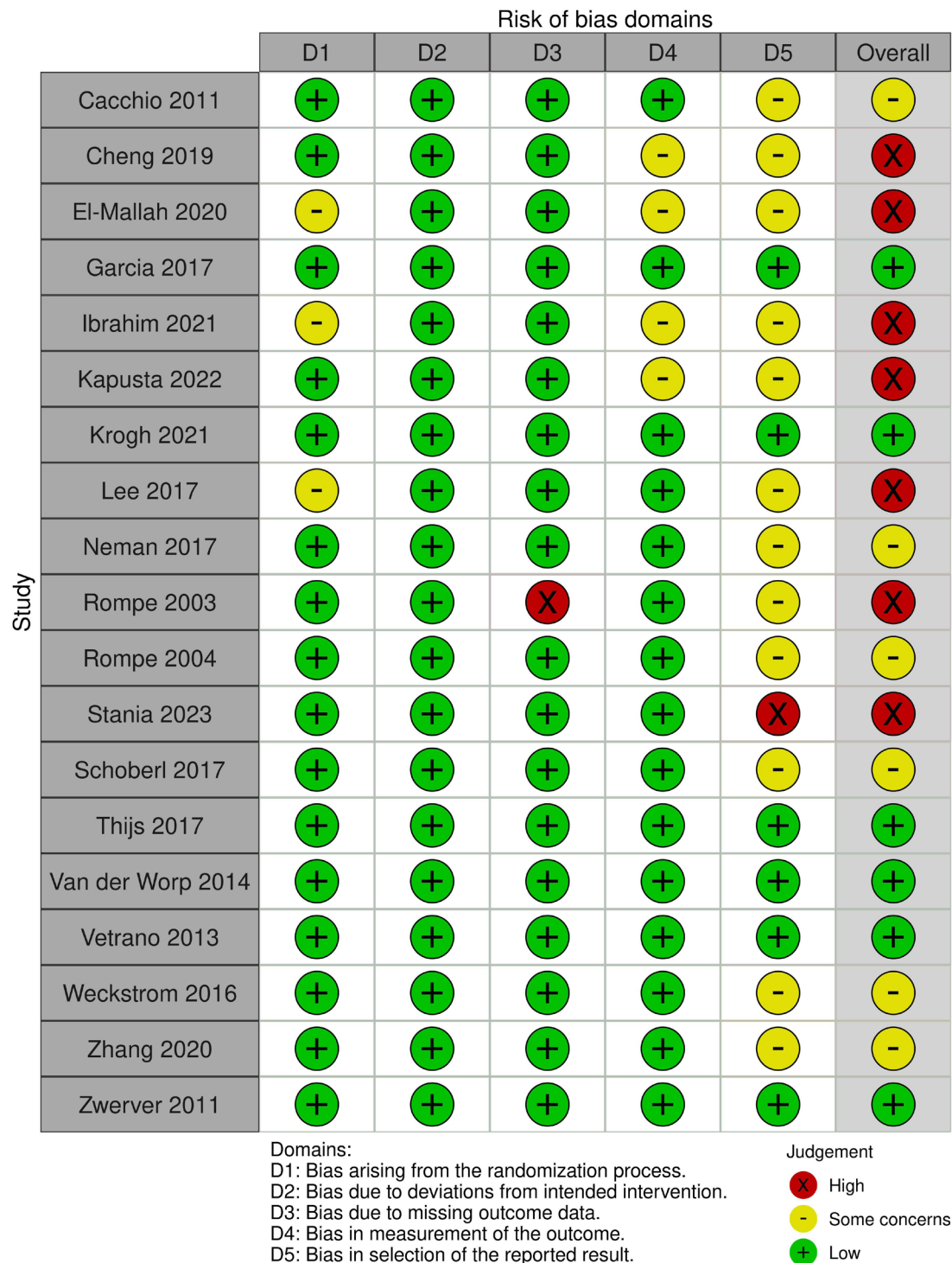
Figure 2 Risk-of-bias assessment for randomised controlled trials.

treatments 2 weeks prior to ESWT. Investigators reported that both treatments resulted in significant improvement in pain and American Orthopaedic Foot and Ankle Society (AOFAS) scores at 5-year follow-up. 54 A prospective cohort study with high risk of bias compared endoscopic plantar fasciotomy (EPF) with ESWT and sham ESWT (patients were randomised into ESWT or sham ESWT) in a mixed athlete population. The study showed that EPF resulted in statistically better pain VAS and Roles and Maudsley scores, while there was no significant difference between ESWT and sham ESWT. However, 7 out of 11 patients (1 patient with no return to sport and 3 patients with